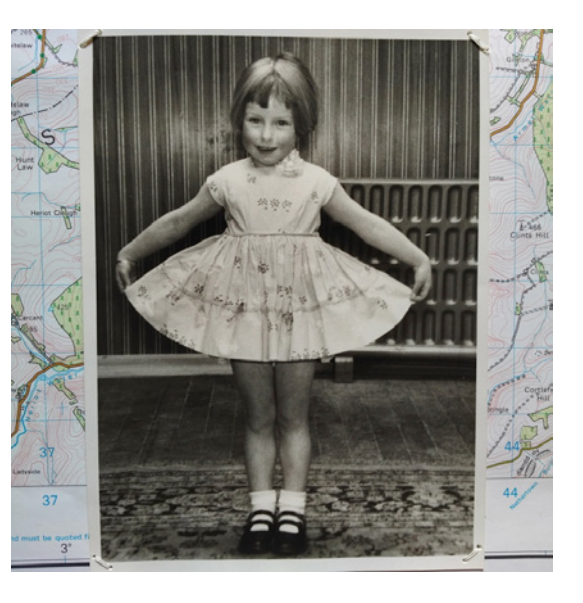
Figure 10: Su Fahy, detail from The Pin-Up Reading Rooms, Stewart Christie Archive, Section 2: The Forth Estuary (2015). Found sepia photograph, black and white photograph, photograph from 2015 photo-shoot, linen thread. Photograph by the artist.

Figure 11: SU Fahy, detail from The Pin-Up Reading Rooms, Stewart Christie Archive, Section: The Forth Estuary (2015). Found black and white photograph, linen thread. Photograph by the artist.