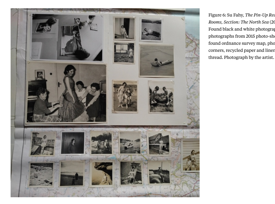
Figure 6: Su Fahy, The Pin-Up Reading Rooms, Section: The North Sea (2015). Found black and white photographs, photographs from 2015 photo-shoot, found ordnance survey map, photo corners, recycled paper and linen

In the studio I feel the methodology of mapping introduces these concepts of association and order with a sense of place. Material maps printed on paper create an immediate, more personal, and more precious intimate space. The material nature of the map, cartographic in discipline, is one that Kim Levin comments on as appearing again and again in contemporary art as a metaphor for its own boundary breaking strategies. Levin states that 'perhaps the map should serve as the preliminary emblem of