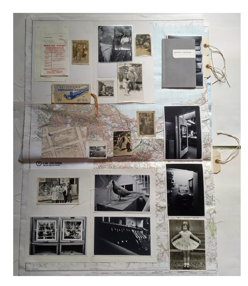
Figure 9: Su Fahy, The Pin-Up Reading Rooms, Stewart Christie Archive, The Forth Estuary (2015). Found black and white photographs, black and white photographs from 2015 photo-shoot, ephemera, ordnance survey map, linen thread, film negative packet, small diary, recycled paper luggage labels.