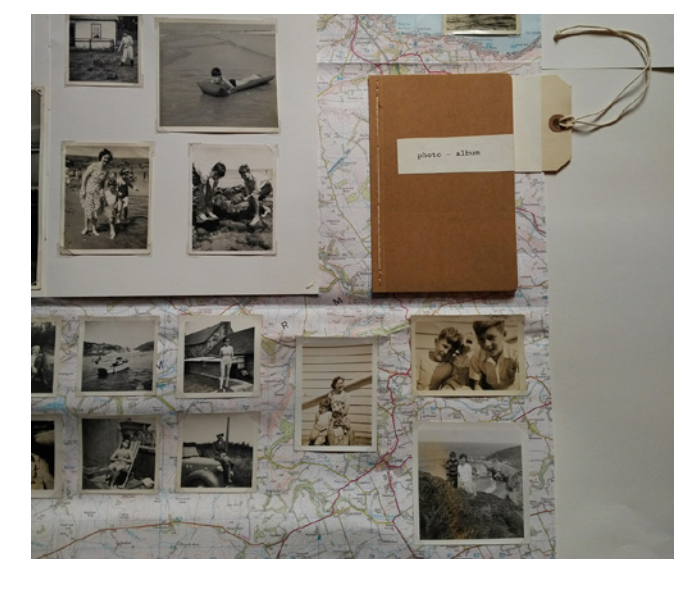
Figure 8: Su Fahy, detail from The Pin-Up Reading Rooms, Section: The Forth Estuary (2015). Found black and white photograph, photo corners. Photograph by the artist.

Figure 7: Su Fahy, The Pin-Up Reading Rooms, Section: The North Sea (2015). Found black and white and sepia photographs, photo corners, recycled luggage label, linen thread, small hand-made journal, ordnance survey map. Photograph by the artist.