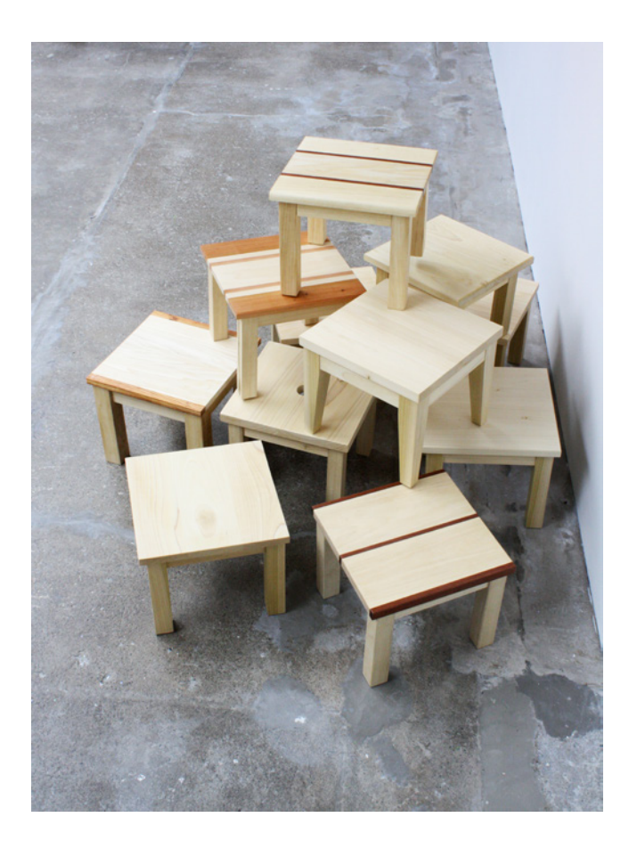
Figure 1: Wooden stools built by students in the class using mortise and tennon construction.

world as book learning becomes more widely disseminated in the global economy. Practical know-how, on the other hand, is always tied to the experience of a particular person. It can't be downloaded, it can only be lived. (Crawford, 2009, pp. 161-162)