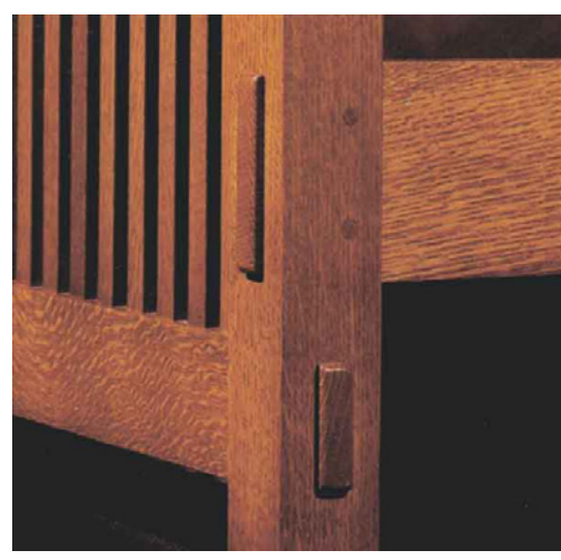
Figure 2: Through-tennon construction on a Stickley settle on view at the Stickley Museum.

to be held and interacted with. This has two effects: It engages the sense of touch in students who are likely to be haptic learners anyway, and it makes a direct connection between what the students are learning in the classroom and the pieces of furniture that are presented in the museum. These simple display joints allow research and discussion across all five of Fleming's basic properties (Fleming, 1974, p. 156). When looking at the property of construction, for example, holding an example of a mortise and tennon joint in one's hand allows one to directly experience the mechanical advantage afforded by the shoulders on the tennon in a way that cannot be experienced from a printed page or a web interface.