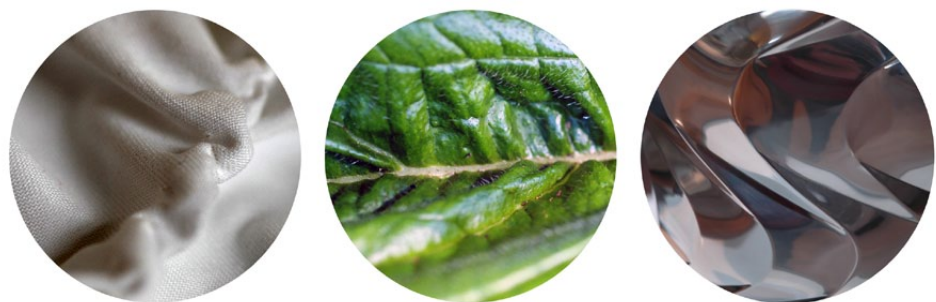
Figure 11 (left): Photographic spot series, my fabric folds – Running stitch on polyester.

To generate initial ideas a brainstorming exercise was carried out, noting a wide range of folded materials and objects as well as where they might be found. To limit opportunities for self-censorship at this stage and maximise the quantity of ideas produced it was beneficial to carry out the exercise within a short time frame and at high speed. This led on to a process of diverse and playful exploration, the creation of a photographic series. The images were thematically united by the fold and clearly connected by the format of presentation: visual explorations bounded by their frames but components of a divergent and potentially infinite series (figure 11).