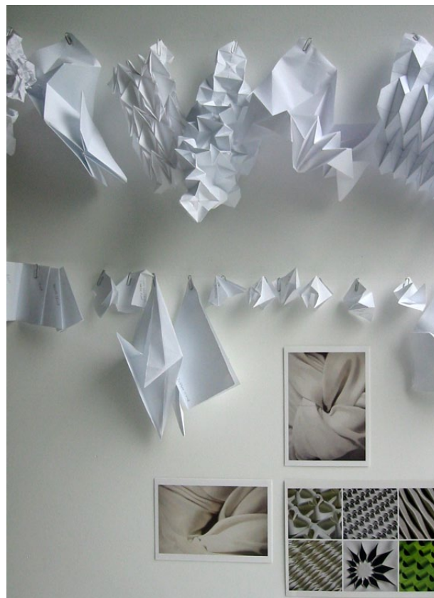
Figure 3: Origami 'washing line' and postcards, from initial collection of diverse elements.

As discussed previously, diverse exploration is often adopted at start of the design or practice-led research process to generate and note initial ideas. In my case this playful compilation of fragments included still and moving images, texts, samples, objects, an eclectic mix of materials collected from external sources as well as self-generated through studio practice and its documentation (figure 3).