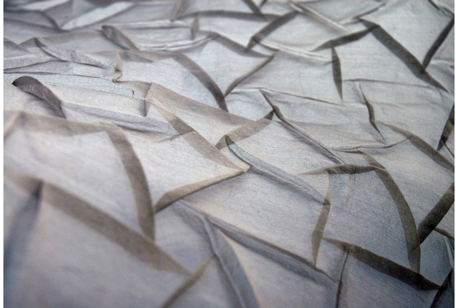
Figure 2: Moulded silk-organza using an origami pattern designed by Alex Bateman.

sisted me to understand fully how classic origami bases might be dismantled and reconfigured in novel ways.