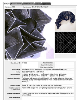
Figure 10 (right): Example of electronic database entry.