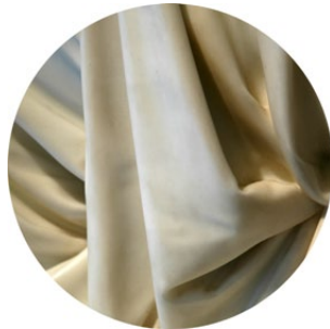
Figure 14: Photographic spot series, false folds – Marble sculpture 'Maternal Affection', Hodges-Baily, 1837, V&A Museum, London.

From the primary loose thematic boundary sprung new and tighter categories as images were evaluated and compared: a process of specific focused exploration. An investigation of different types of folds with contrasting properties and behaviours resulted in the categorisation of a number of distinct folding types. Collections of 'Natural' and 'Man-made' folds were collated from a number of walks and the observation of my local environment (figures 12 & 13). A series of photographs of sculpted drapery elicited the category of 'false folds' (figure 14), immobile folds carved from intransigent materials that possess only the appearance of pliability and dynamism. These groupings arranging like with like began to describe a branching system of classification, a ranked hierarchy in which main classes divided and subdivided. Verbally conceptualised categories such as 'controlled' and 'uncontrolled' or 'hard' and 'soft' folds emerged from visual taxonomies, intertwining theory and practice.