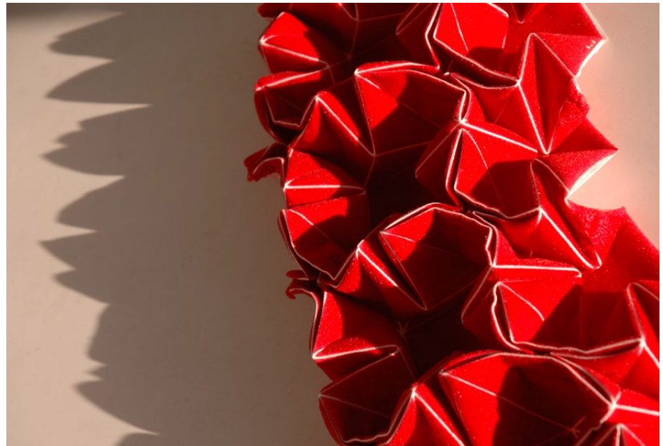
Figure 1: Deployable textile structure, silk-screen printed and hand folded polyesther.

My practice-led PhD research developed production processes incorporating origami, shibori, printing and fusing techniques to create textiles that sustain three-dimensional, adaptable form with little or no supporting substructure (figure 1).