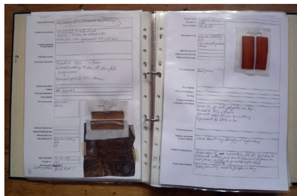
Figure 9 (left): Paper-based datasheets.

These physical records provided a backbone to the research practice, capturing information about activities and approaches unnoticed at the time of making that were only recognised through later analysis and evaluation. They were ultimately organised into multiple archives and searchable electronic databases that encompassed the multiple methods, perspectives and potentialities of the project (figure 10).