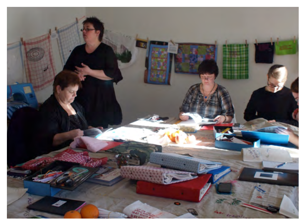
Figure 2. Educational sewing circle in Östersund, 2011.

As an important part of making Threads travel we hand over the role of being host to local actors. To facilitate this process we host educational sewing circles where we suggest patterns of how to assemble, manage and disassemble the sewing circle, so the future hosts can learn from practice.