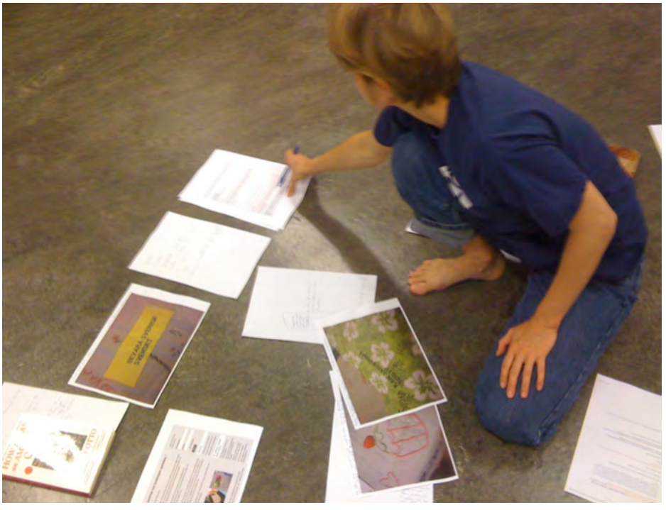
Figure 6. Working with patches.

As part of our writing process and patch working, we spread and move around fragments on the floor from manuals, contracts, field notes, images - either taken by us or uploaded on the website by other participants, and email conversations and text messages sent to us by collaborators. This was an attempt to acknowledge that the writing process is a highly material and spatial practice. At that time, we did not know exactly how to make the patches work, and which patches to include or exclude. We came to learn that much work had to be put into the seams that separate, as well as hold together, the patches.