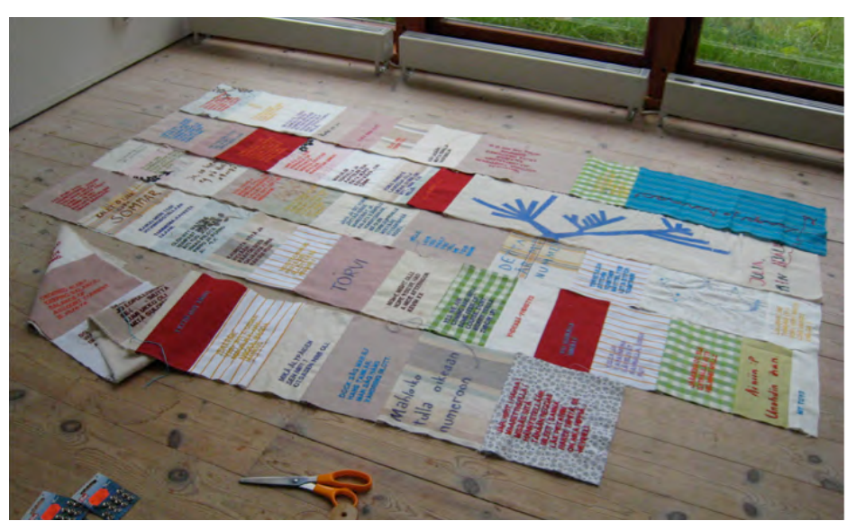
Figure 1. Aligning patches of embroidered SMS and stitching them together into a patchwork.

The sewing circle stitching together was conceptualised by us for the 2007 exhibition Digitally Yours in Turku, Finland. It derived from an interest and desire to explore our relationships and interactions with others in physical, digital and in-between worlds. Over a six-week