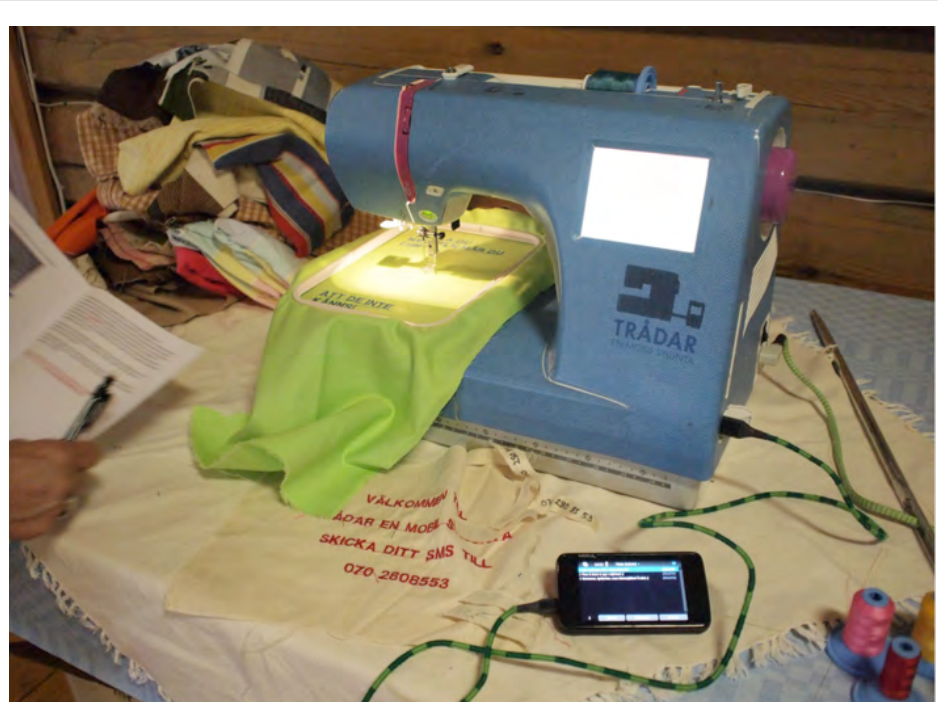
Figure 3. A mobile phone with bespoke software for translating SMS to a specific file format and transferring it to the embroidery machine. Assembled in Gafsele, 2011.

From the messages that are embroidered, some are left in the sewing circle to be shared with future participants. These messages are hung on clotheslines stretched along the walls and across rooms as well as outdoors to advertise Threads ' presence. Participants can upload their own documentation of their embroideries to a website: www.mobilsyjunta.se. Instead of working with a patchwork, as we did in stitching together, Threads utilises clotheslines as a means of aligning and separating the embroidered text messages.