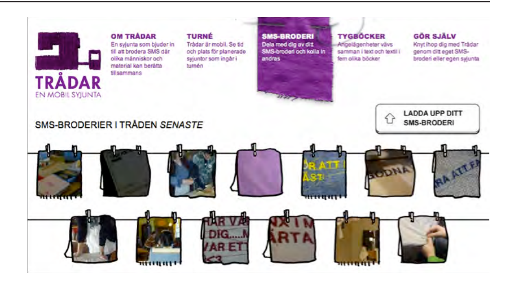
Figure 5. Images from Threads displayed on digital clotheslines at www.mobilsyjunta.se.

However, in this paper we want to return to the patchwork as an object and a practice, and stitch together accounts of Threads into a patchwork of texts and images.