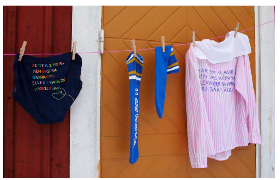
Figure 4. Embroideries hung on clotheslines when Threads visited Järnboås, 2010.

From the messages that are embroidered, some are left in the sewing circle to be shared with future participants. These messages are hung on clotheslines stretched along the walls and across rooms as well as outdoors to advertise Threads ' presence. Participants can upload their own documentation of their embroideries to a website: www.mobilsyjunta.se. Instead of working with a patchwork, as we did in stitching together, Threads utilises clotheslines as a means of aligning and separating the embroidered text messages.