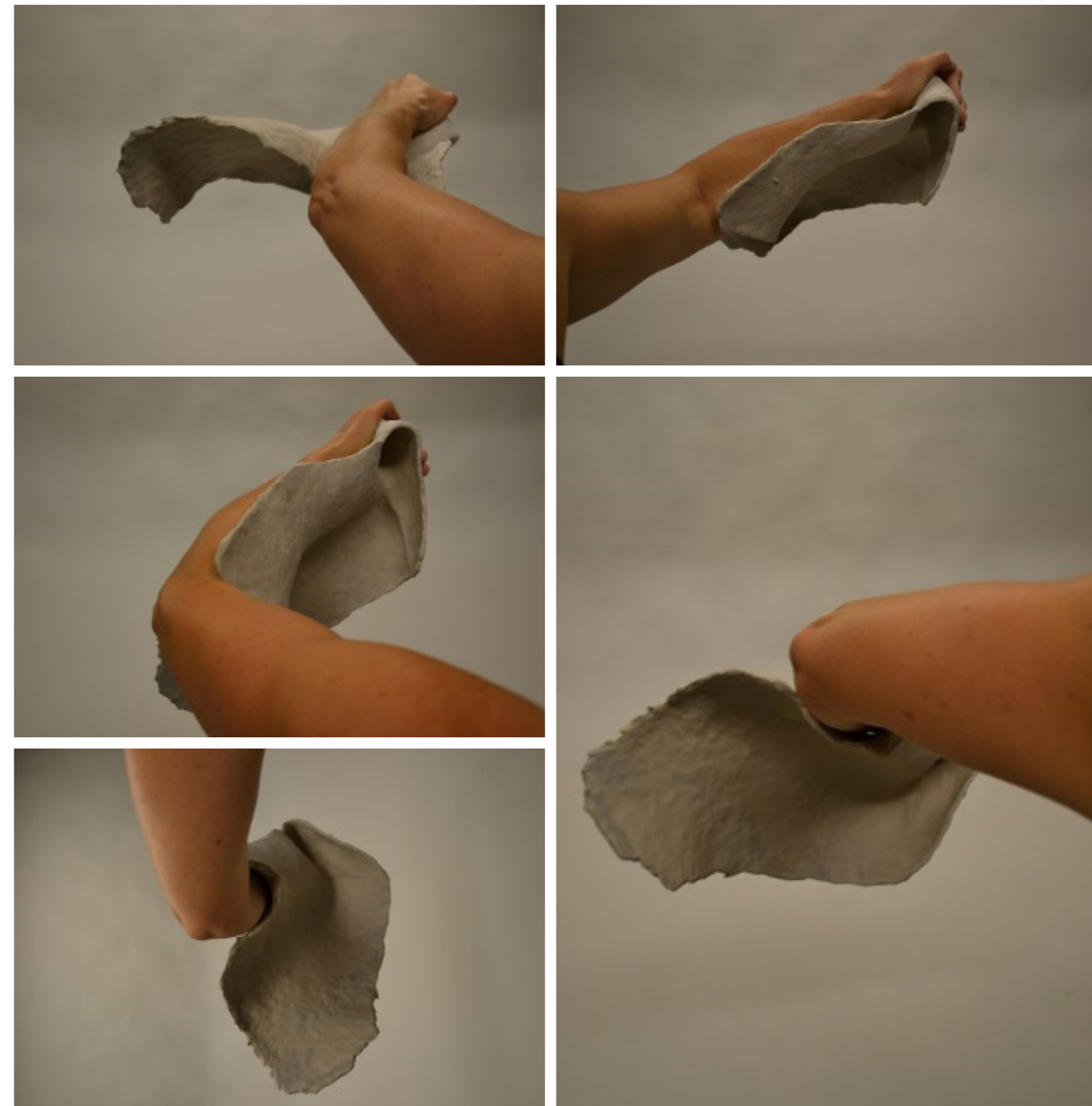
Figure 4 / Photos showing activated forms from of the series Body-Shell.