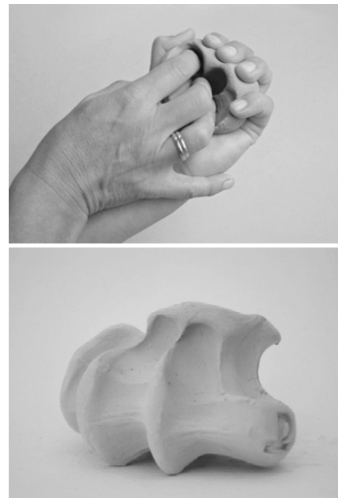
Figure 2 / Photos of Handforms: from the form process and the finished object.