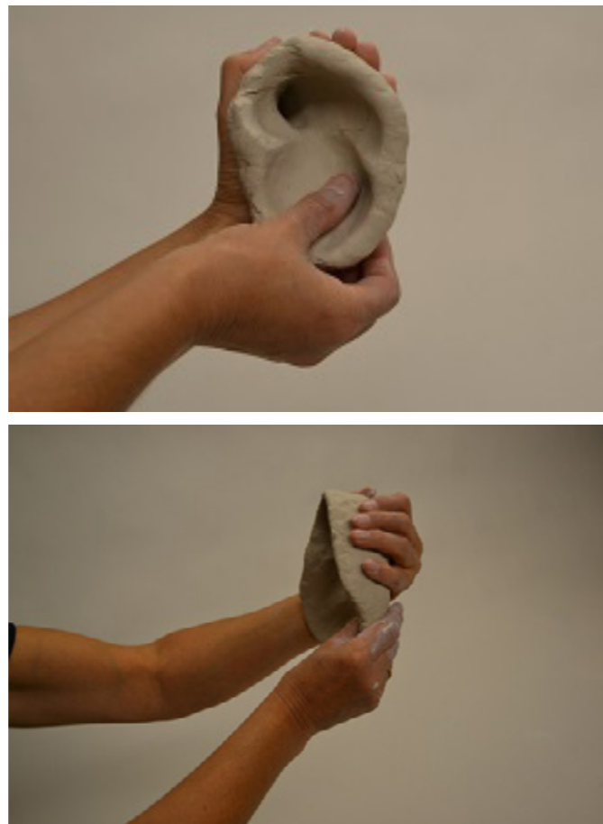
Figure 3 / Photos showing the form-process of a Body-Shell, a stage from the hollowing and extending of the spherical clay form.

Figure 4 illustrates my experiences of finished, dried clay forms—the photos showing various positions and movements of the hands, arms and form, and how all interact and relate to one another. I perceive the form in relation to my body as: above-and-away; emerging-from-enclosing; toward-overlapping; undercover-straight-out and from-above-and-beyond. Sometimes, the difference between what is inside or outside the form disappears. This is similar to my experience of interaction between form and body through the clay during the shaping process. The interplay between convex and concave forms takes place in my body as a continuous movement.